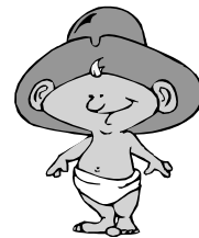
"Competition Secretary in his younger days"

usually fast an furious and done at close range where having safe fun is as important as hitting the target. Western dress is optional. Watch out in the forthcoming event section for details.